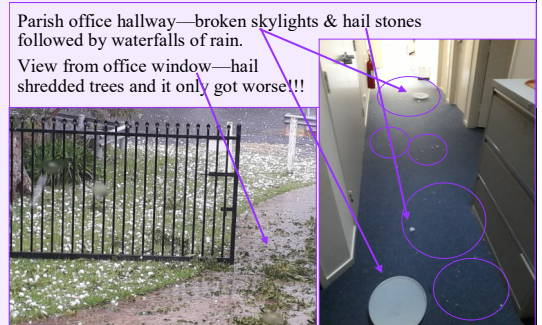
Parish office hallway—broken skylights & hail stones followed by waterfalls of rain. View from office window—hail shredded trees and it only got worse!!!

This was extremely disappointing for all involved after the months of planning and practising. Please keep all those affected in your prayers and give prayers of thanks for all members of the SES who braved the dangerous conditions to keep others safe.