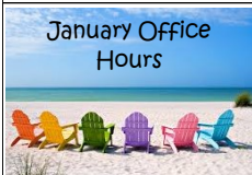
January Office Hours

Come and take part in the Celebration of Christmas. The more the merrier!